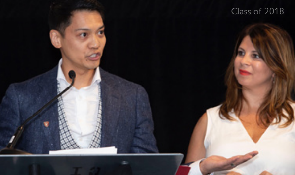
Class of 2018

"I expected a challenging 2-year academic endeavor, and truth be told the experience was so much more than that. From navigating the unexpected complexities of team work, to the challenges of time management, the program took me far beyond my comfort zone. While I learned the essentials of marketing, accounting and finance, my most important take away has been a realization of what I am capable of accomplishing. The program has provided me with the confidence to seek out and accept new challenges, both personally and professionally, that would have previously felt out of my reach."