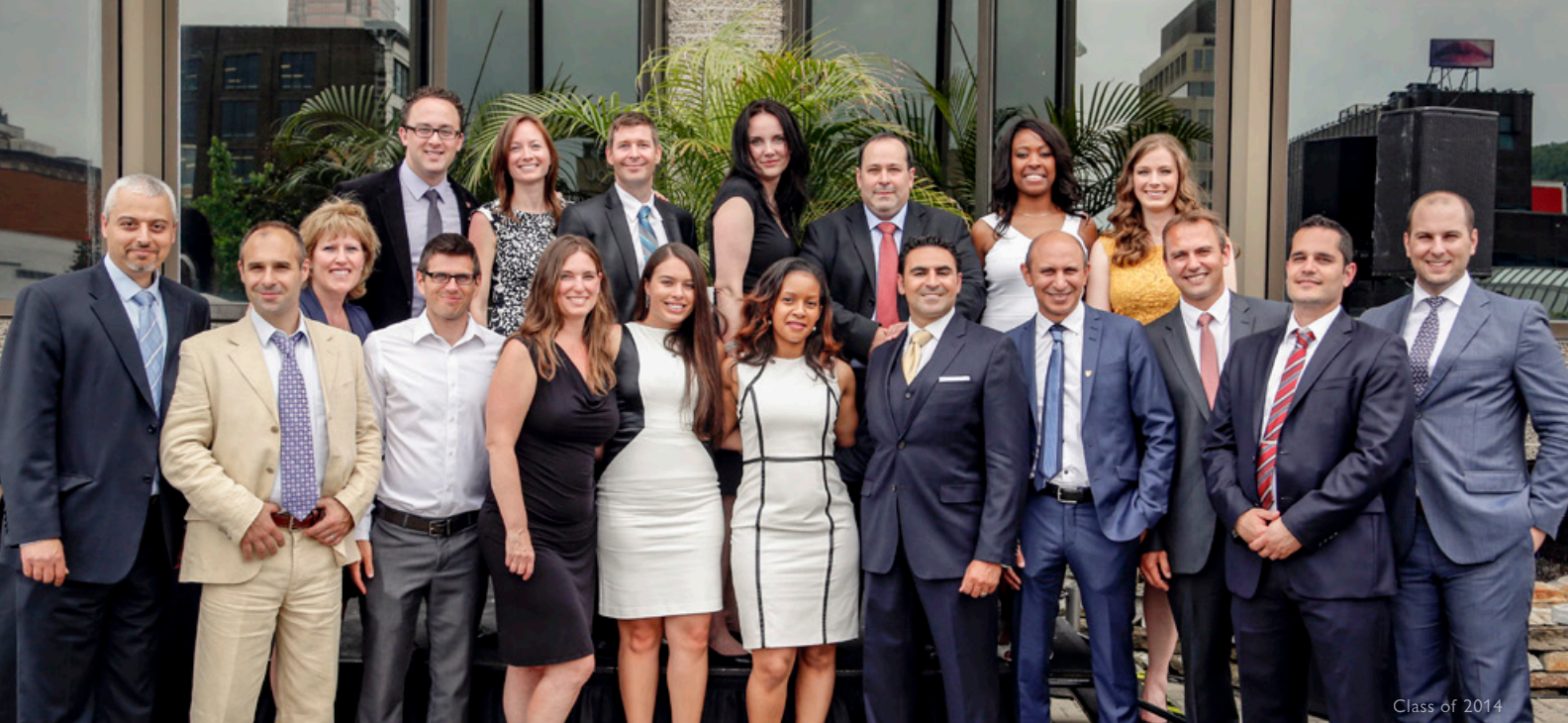
Class of 2014