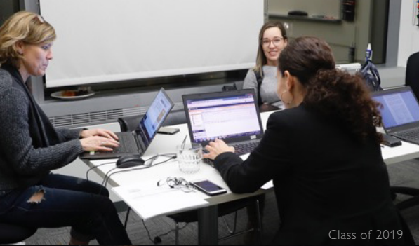
Class of 2019