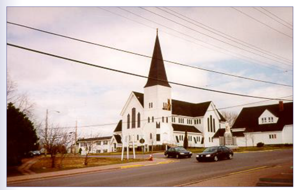
Springhill, Nova Scotia

No specific plans at the present time, but as the projects unfold these plans will be developed. We are also committed to contributing to the "In Sites / Insights flyers" as well to preparing various popular media articles from existing and emerging data.