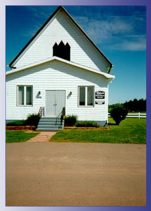
Lot 16, Prince Edward Island

1. In Lot 16 one of the NRE2 sites, the community is moving forward with discussions to establish a legally incorporated community development organization with authority to plan community projects, receive funding (grants, contracts etc.), and provide a structure for the community to plan for the future. Community members have been inspired by the outcomes of the research we have been doing - about the high levels of participation, the strong level of social cohesion, etc. They are making use of the community mapping exercise that was conducted as part of the Household survey in 2001 to help them demonstrate to government that there is a shared sense of identity and community. They have also benefited from having the Japanese delegation visit their area in 2002, and have high expectations about benefits resulting from community members traveling to Japan and to the fall workshop in St-Damase.