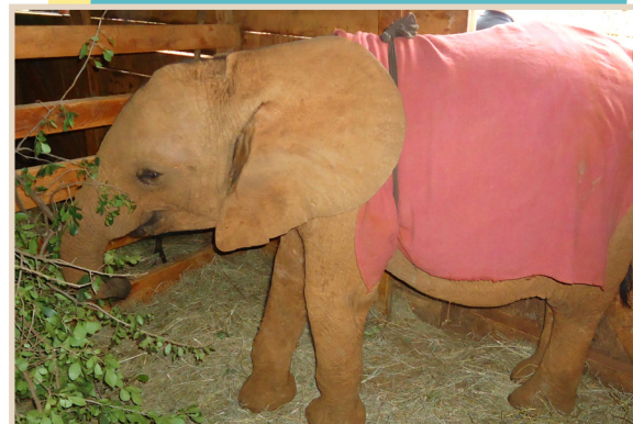
Tano enjoys some fresh leaves and the protective warmth of a donated blanket