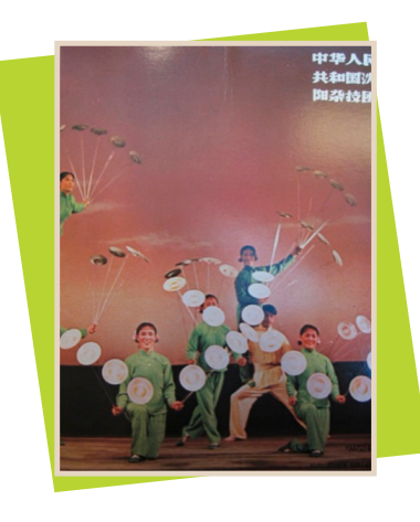
The front cover of the Shenyang U.S. Souvenir Program, 1972.