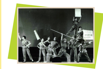
A revolutionary acrobatic play made in Shanghai. Source: Private Archive (1967).