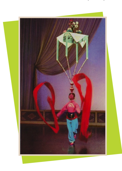
A woman juggler performs yangge.