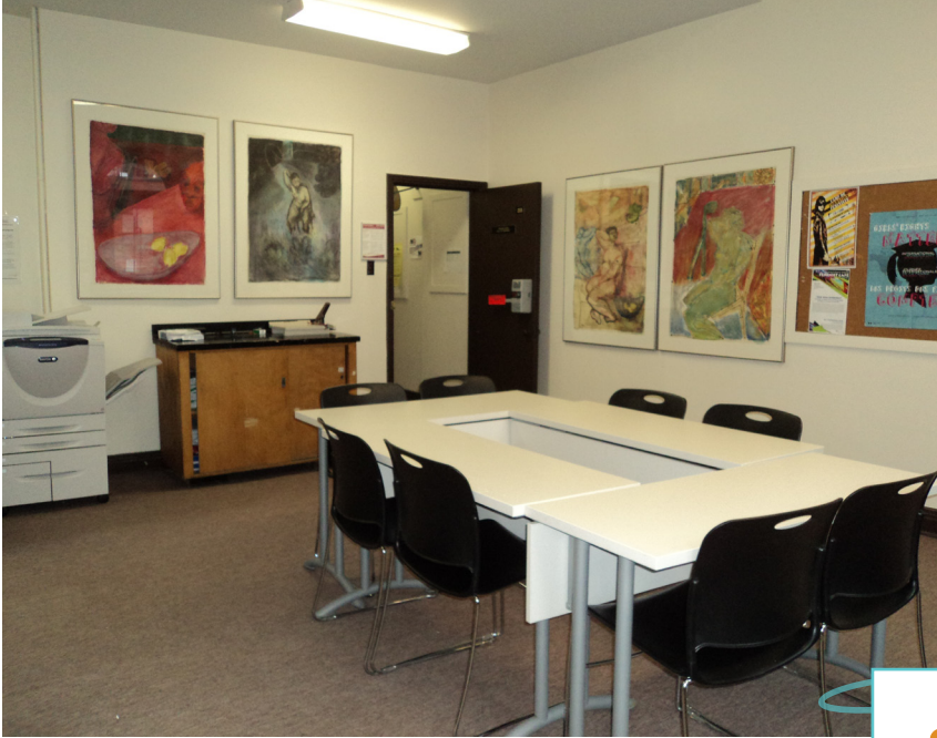
The newly decorated lounge