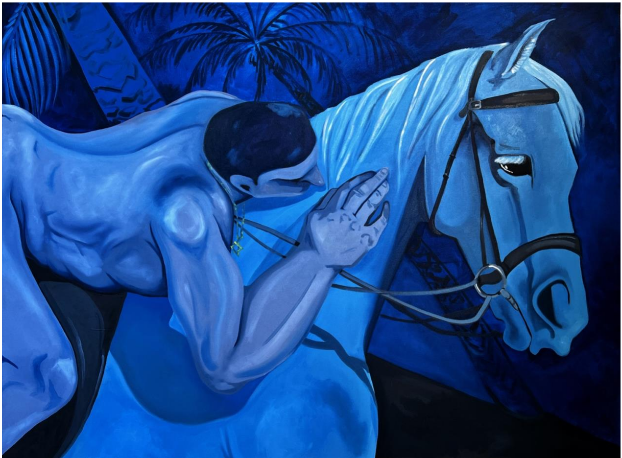
Noa Ironic, Mediterranean Nights , 2022.

reasons I am so strongly drawn to Ironic's images. The work she is creating is bridging the gap between the extreme environment of the conflict and the everyday reality of life in Israel in an intentional, consequential way. Her work also confronts head-on the international phenomenon of denying Israelis an existence outside of the Israeli-Palestinian conflict. As an artist, she tells me, she seeks to show a more complete picture of Israel which does not erase problematic or painful parts of reality but includes them alongside the many unproblematic stories and elements of everyday people and life here. In this space between 'problematic' and 'unproblematic', Ironic's images have the freedom to reflect complex narratives and stories not bound by political bias or ideology; her characters simply exist and represent the imperfectness of reality.