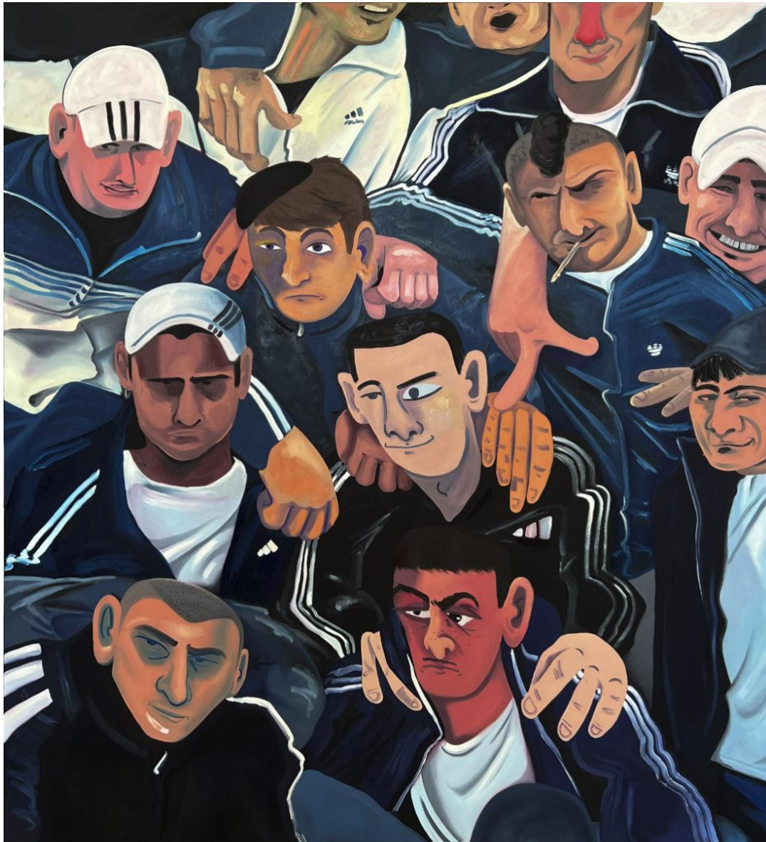
Noa Ironic, Beautiful People Only , 2022.