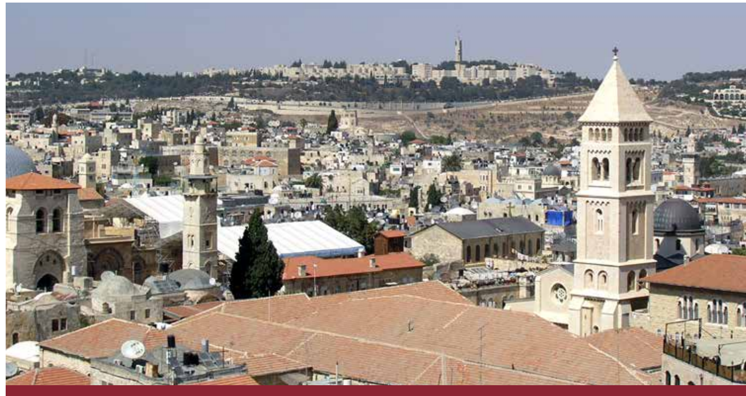
Hebrew University seen from Jerusalem.

experiences with those looking to convert to Judaism. His temple, he says, "will use me in the future to teach new people coming in about some aspects of Israel, especially the political one."