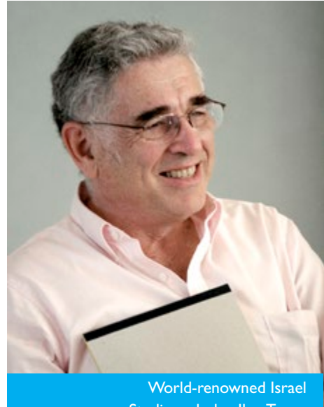
Studies scholar, Ilan Troen

For instance, while writings in the 1960s were favourable to Israel, an increasing crescendo of criticism began to develop following the 1967 Six-Day War. Analysts and social scientists exposed problems and delved into the Arab-Israeli conflict, compelling a rethinking of the former celebrationist view. "Things that were once believed to be untouchable and sacred were all of a sudden open for scrutiny."