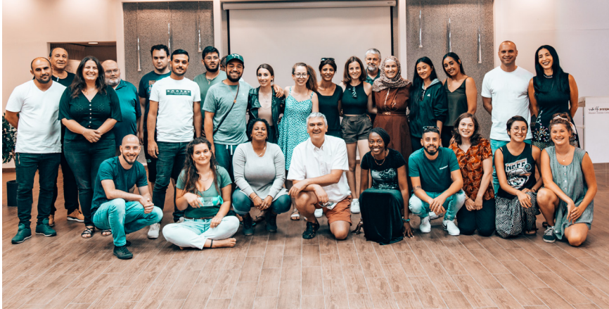
Students from the Azrieli Institute and Western Galilee College explored the deeper meanings of multiculturalism and intersectionality